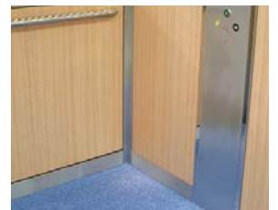
Enhanced An example of a typical interior