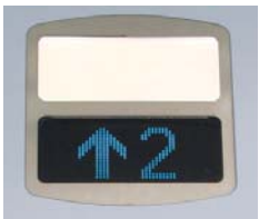
Optional blue DDU