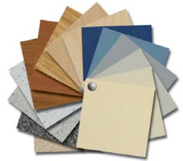
Range of laminate wallboards