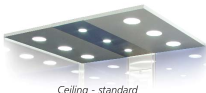
Ceiling - standard