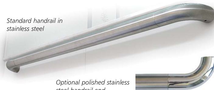
Optional polished stainless steel handrail end