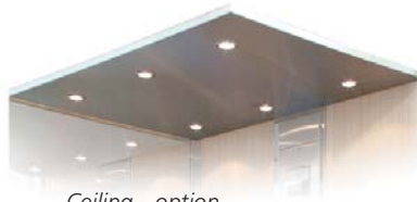
Ceiling - option