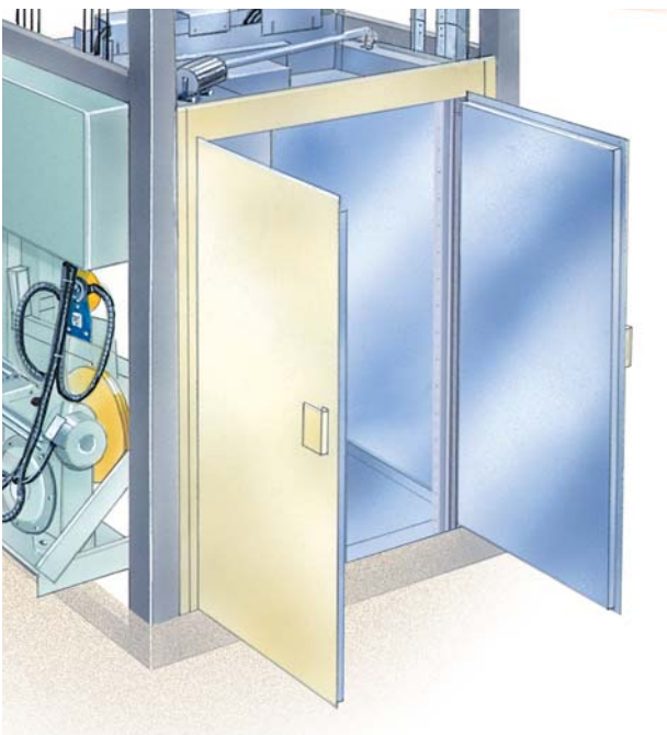
Double hinged steel door on 1305 and 1445mm wide cars

Sheet steel motor-room cabinet and shaft cladding (non fire rated) available as an optional extra.