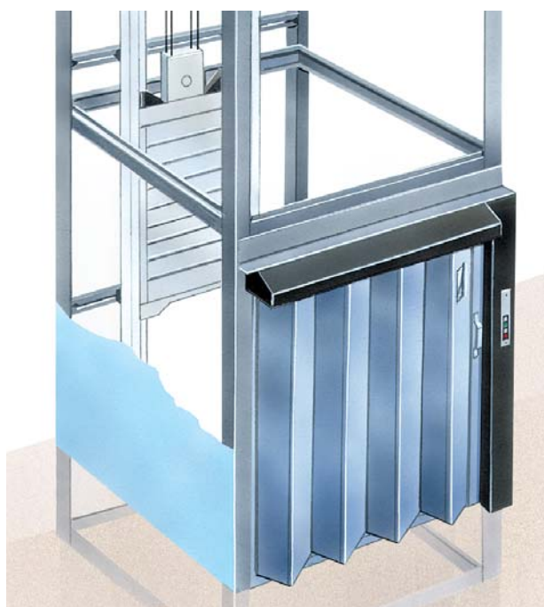
Illustration shows shutter leaf gate which can be installed as an optional extra

To protect loads during travel, a collapsible picket gate, electrically interlocked for safety, is available if required.